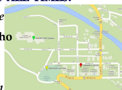
Poster designed by Susan Bond